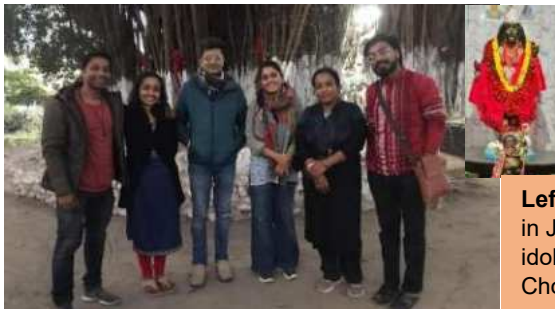
Left: The ACT delegation in Jalpaiguri; Inset: The idol inside the Debi Choudhurani temple