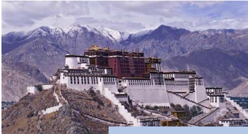
The Potala Palace in Lhasa is the seat of the Dalai Lama as well as a UNESCO World Heritage Site

mother got the title of Gyayum Chemo, meaning the great mother. Their status and wealth increased drastically with the Tibetan Government providing the family all the comforts due to the first family of Tibet. They were granted