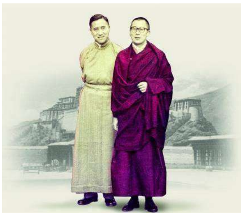
Brothers-in-arms: Gyalo Thondup (left) and his younger brother Lhamo Thondup who is the 14th Dalai Lama

Born in the remote village of Taktser, in Amdo province of Eastern Tibet, Gyalo Thondup spent his early life in Lhasa, after his brother was recognized as the 14th Dalai