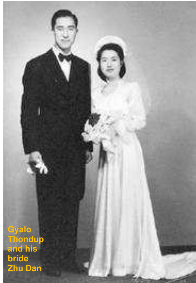
Gyalo Thondup and his bride Zhu Dan

After the death of the two, the Tibetan government wanted Gyalo Thondup to return to Tibet but he refused to do so till he completed his studies in Nanjing. His decision was also prompted by apprehensions on his security now that his two main supporters were no longer alive and that people opposed to them were in the helm of affairs in Tibet. But return he had to on being forced to do so after the Communist takeover of China. From Hong Kong he made his way to Kalimpong wherefrom he got in touch with his mother who was still in Lhasa. His mother instructed him not to travel back to Lhasa. Since Gyalo Thondup's wife was expecting their first child and medical facilities in Kalimpong being poor, they decided to shift base to Kolkata.