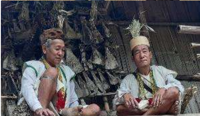
Moods of the month from Arunachal Pradesh